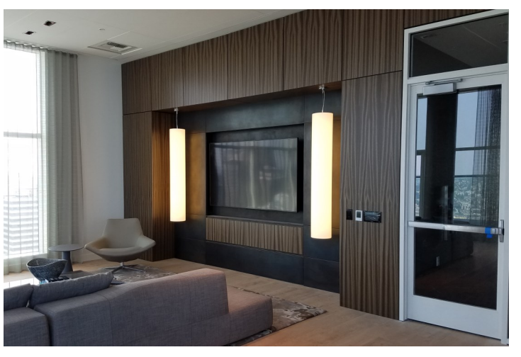
Photos of the Helios in Seattle, Washington. The Helios Concierge Desk and Club Room. Woodwork supplied and installed by Bruce Matson Company Inc.