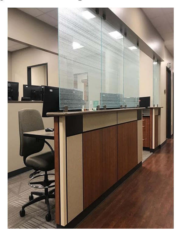
Photos of the Oceano Community Health Center in Oceano, CA. Custom reception area and nurses station created by Custom Source Woodworking.